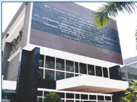
PDUNIPPD, New Delhi

Institutes under the Department of Empowerment for PwD (Divyangjan) Ministry of Social Justice & Empowerment, Government of India